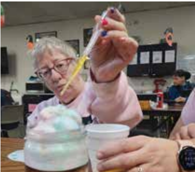
Barbie participated in a fun lesson about clouds and rainbows, conducting an experiment using shaving cream to represent clouds.