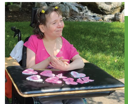
In honor of Father's Day, individuals at the Hummelstown Campus created sugar hearts with messages to their fathers.