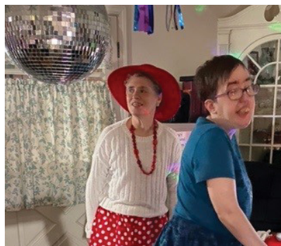
Virtual Dance Parties are being held throughout Merakey IDD with fun themes and contests, music, and dancing. To be included in the next dance party, email Merakey_AVS@merakey.org .