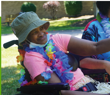
The Pittsburgh Campus created their own island getaway with a Luau for 500 individuals and staff members. The Hawaiian-themed celebration was complete with beautiful weather, homemade decorations, Elvis, a smoking volcano, an imitation pig roast, delicious food and drinks, music, dancing, and games.