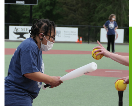
PLAY BALL! Miracle League baseball was held in the summer with games being played at Cranberry Township and Moon Miracle League fields.