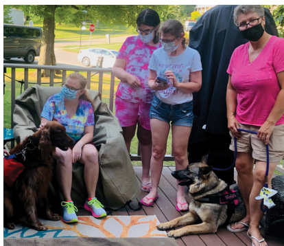
Many are making new friends with pet therapy dogs from Happy Trails Training LLC.