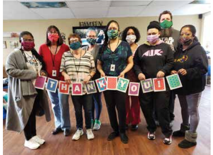
Staff members are grateful for the community's support.