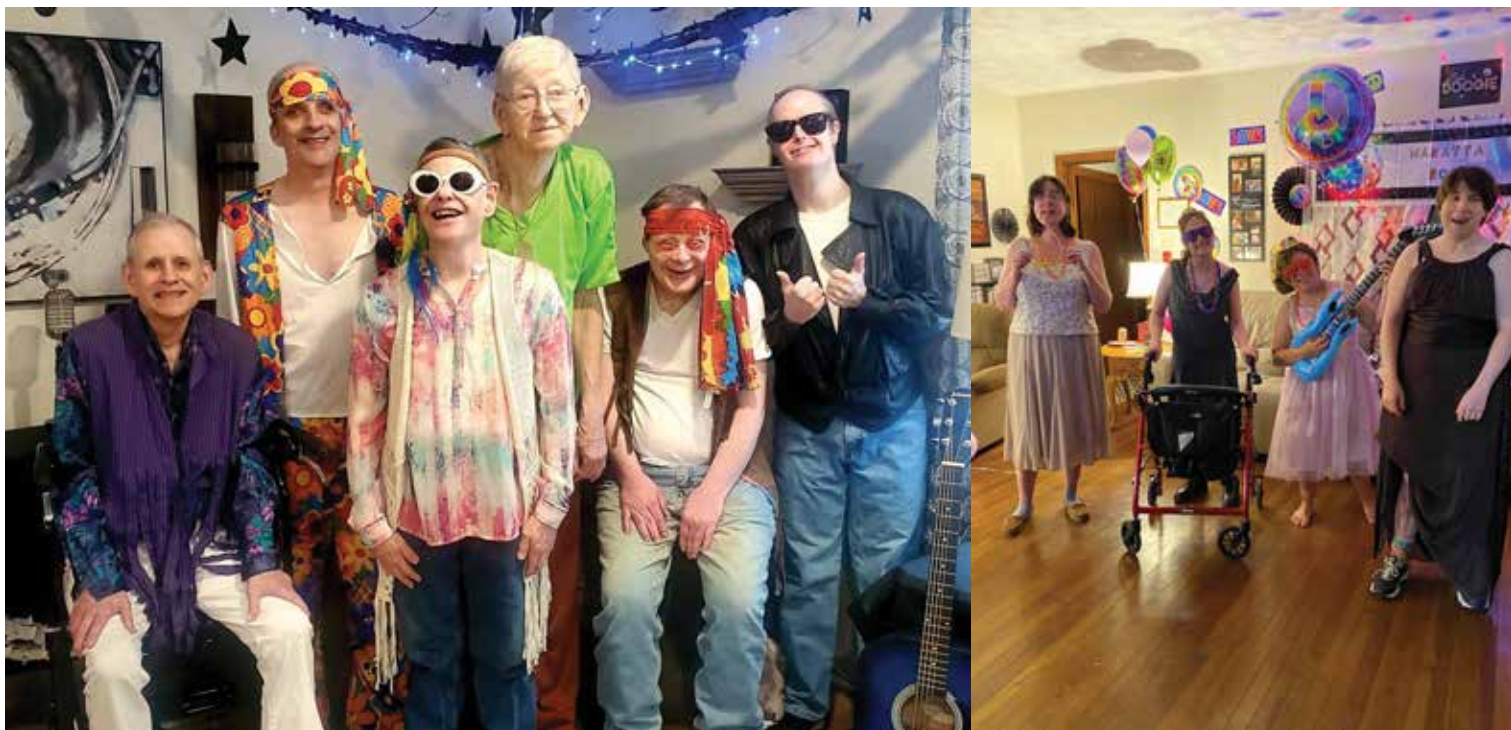
The gentlemen from Branchton chose a 1960s theme, while the ladies from Maratta decked out in formal attire.

A big THANK YOU to everyone who helped to make the Merakey Bandstand Bash possible!